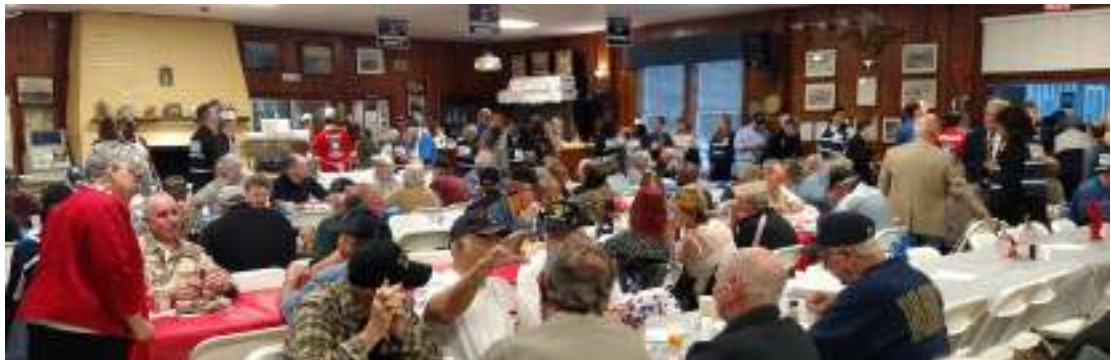
Photo: 2015 Veterans Day Breakfast at American Legion Post 13

Who is a Veteran? He is the old guy bagging groceries at the supermarket.