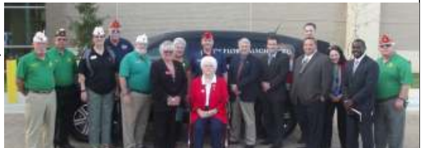
National Commander and entourage at the new VA Clinic.