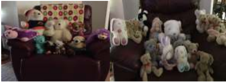
TWO BAGS FULL !!!!!!!!!!!!!!!!!!!!!!!

That is what was delivered to the Leon County Sheriffs' Department on Friday, November 11th. Two bags of slightly used stuffed animals for the deputies to hand out to a child in stress when called to homes of violence or fire, answering calls that might affect a child. Something to hold and love is so comforting when children witness violent crimes. The Auxiliary is serving our community as well as our veterans.