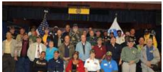
Above: US Army Veterans