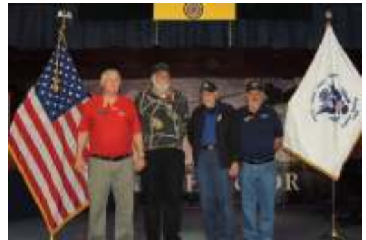
Above: US Coast Guard Veterans