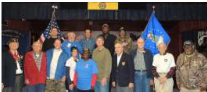
Above: US Air Force Veterans